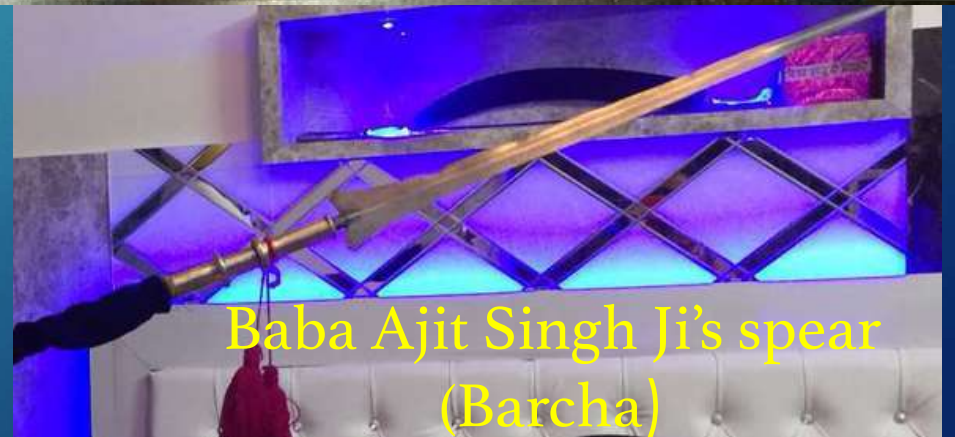
Baba Ajit Singh Ji's spear (Barcha)