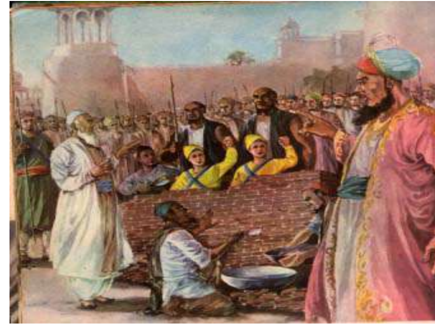
SRI GURU GRANTH SAHIB JI ACADEMY